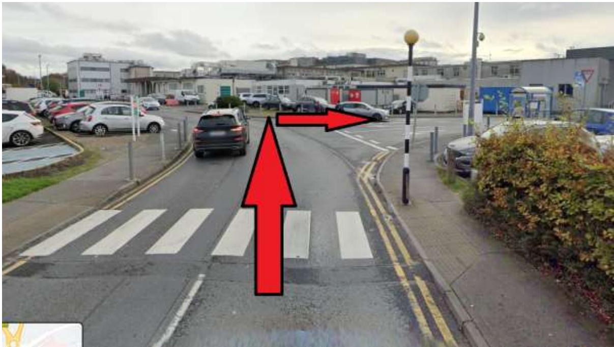
Photo-2; View on passing the Inis Aoibheann Cancer Care West building and seeing the RO building.